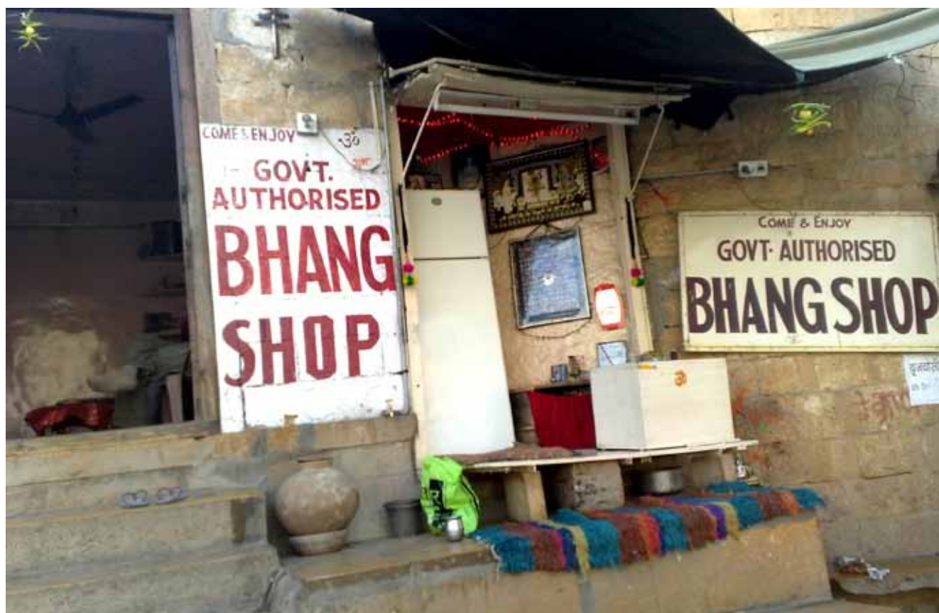
Bhang shop in Jaisalmer, Rajasthan, India.

Probably the best-known example of the latter category is Portugal, which decriminalized drug use, acquisition and possession for personal consumption of all drugs in 2001, for quantities not exceeding what an average user would consume in ten days. Portuguese officials were careful to ensure that the new policy remained within the “mainstream of international drug policy” and that decriminalization was consistent with the relevant provisions of the 1988 Convention. It was the Portuguese view that replacing criminalization with administrative regulations maintained the international obligation to prohibit those activities and behaviours. 21 Drug use, acquisition and possession for personal consumption are no longer considered a crime, although administrative