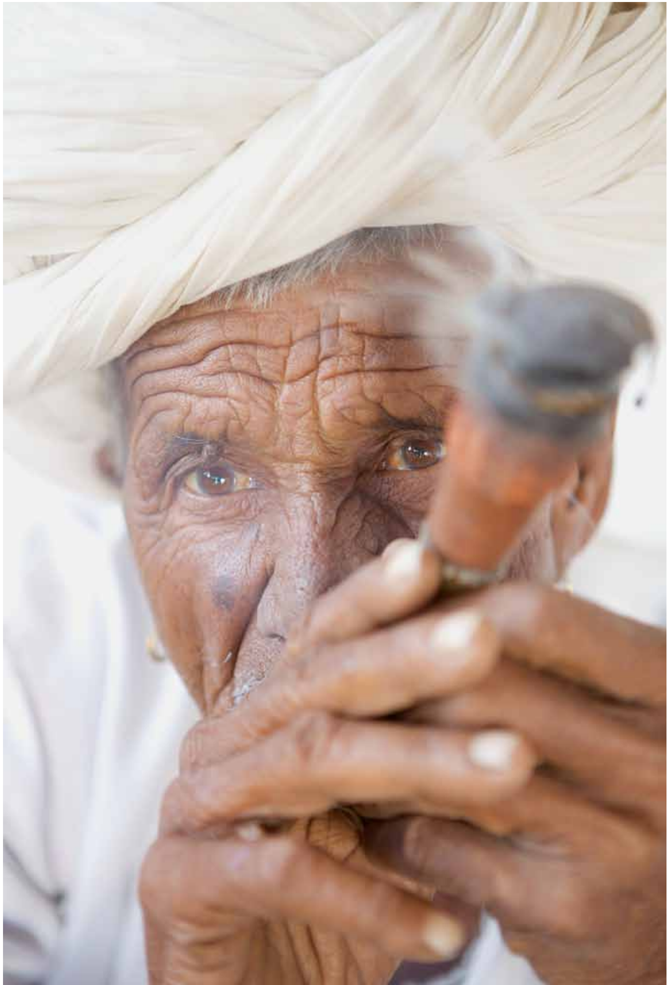
Bisnoi men smoking a pipe.