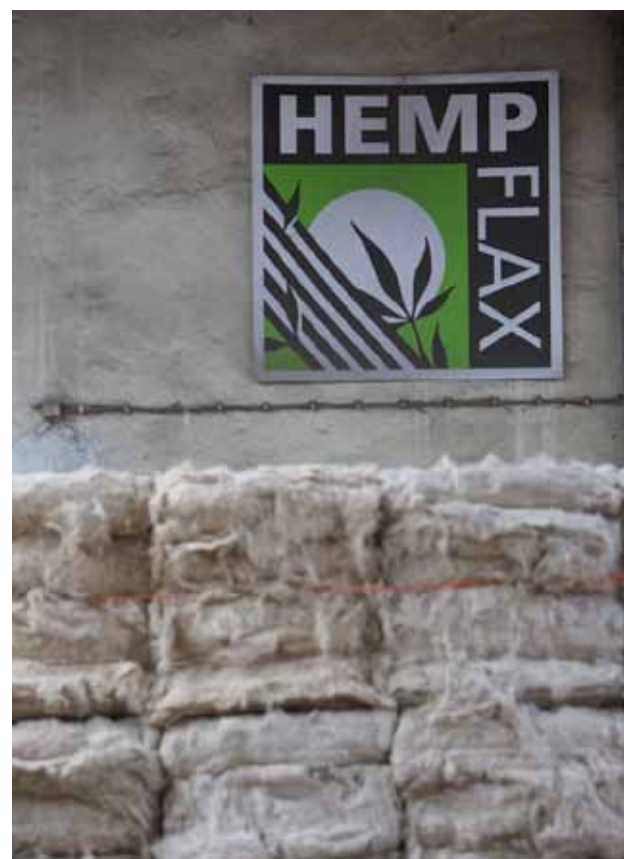
Collection Hash Marihuana & Hemp Museum Amsterdam/Barcelona

Industrial uses of hemp. Article 28 of the 1961 Convention specifies that the treaty does “not apply to the cultivation of the cannabis plant exclusively for industrial purposes (fibre and seed) or horticultural purposes”. Varieties of the cannabis plant with relatively low psychoactive cannabinoid content, usually referred to as “hemp” instead of “cannabis”, have been widely used for its fibre to make paper, denim or sails. The legitimate hemp industry has suffered hugely from the controls imposed on cannabis, but is experiencing a comeback. The treaty explicitly left the use of cannabis for such purposes open, but posed